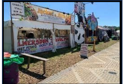
Kilmersdon School at Glastonbury Festival