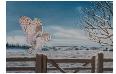
Pastel drawing "Barn Owl in Winter" by Diana Walker