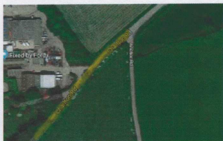
Charmborough Grit bin.JPG 42K